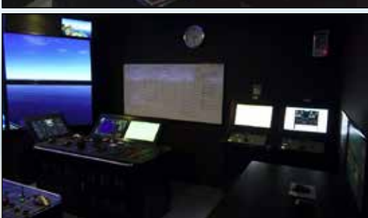
ARI Simulation Class B DP Simulator